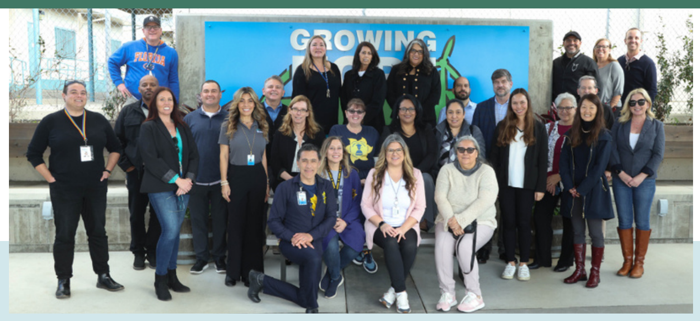
Members of the California Learning Collaborative on Alternative Education, including school principals and district leaders, toured San Andreas High School to learn from its experience in supporting students to pursue and achieve their academic and career goals.