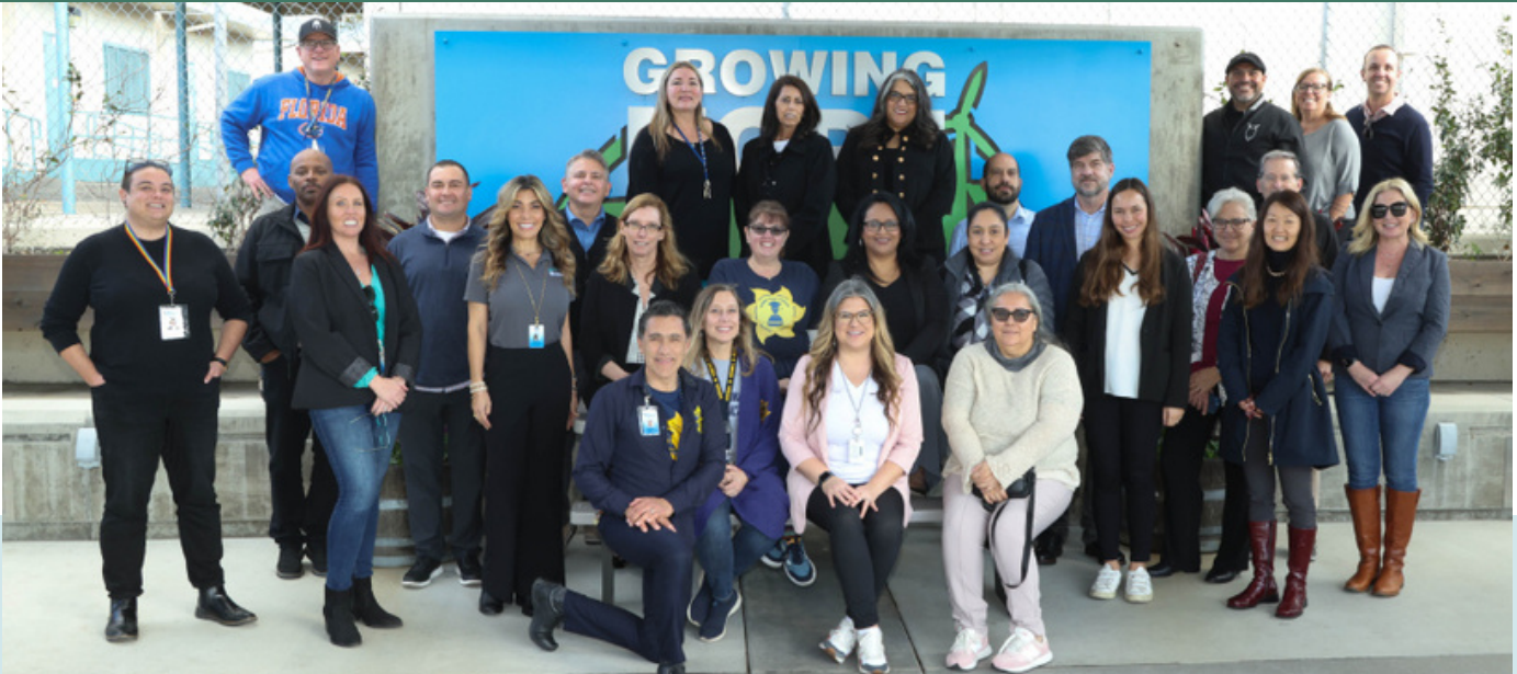
Members of the California Learning Collaborative on Alternative Education, including school principals and district leaders, toured San Andreas High School to learn from its experience in supporting students to pursue and achieve their academic and career goals.