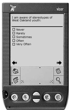
Fig. 2: Sample question from the survey conducted by YELL youth participants, as displayed by the Technos Pro for Palm OS software.

began several weeks earlier by giving each youth one of several handheld computers awarded to the program by Handspring Foundation for use in the project.