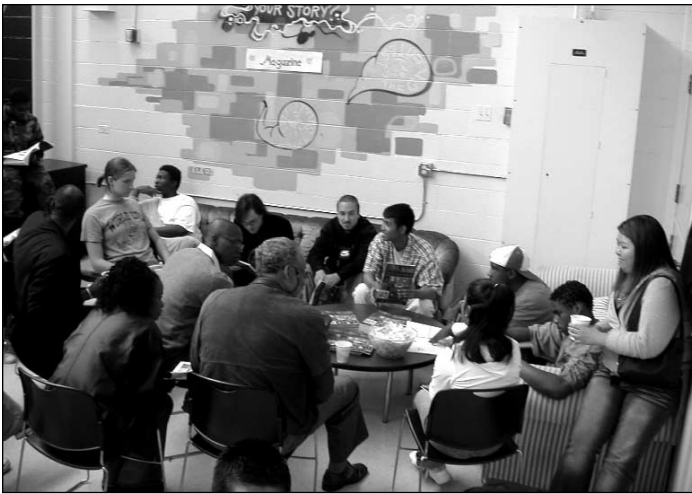
Fig. 5: YELL youth participants engaging peers and adults in a small group discussion at the Community Forum.

these youth worked independently. Provided with a properly formatted data file, they were able to tally results from the survey with no adult help and report their findings to the director.